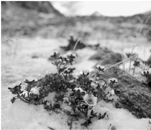
Fig. 1.1. Fit to survive and reproduce under demanding environmental conditions ( Ranunculus glacialis , Alps 2600 m)

may stimulate (in the short term) growth and reproduction, but in the long term, may eliminate an organism from its previously more “limiting” habitat by competitive replacement. Environments are only limiting to those which are not fit.